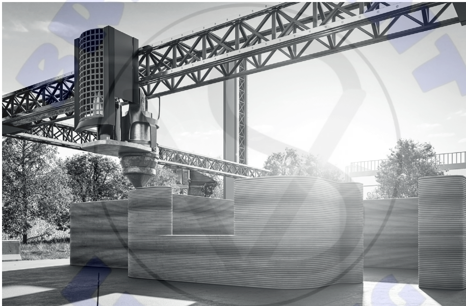
Figure 1: Artist's impression of a 3D-printed house in progress

MFFH manufactures and sells 3D-printed* houses directly to individuals who own land or to local governments, charities, and non-governmental organizations (NGOs) trying to provide affordable housing solutions. MFFH uses cradle-to-cradle design and manufacturing and total quality management (TQM), which strongly influence MFFH 's organizational culture.